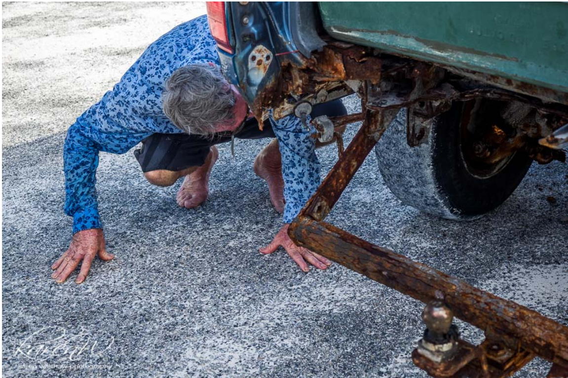
Geof's Pathfinder finally bites the dust