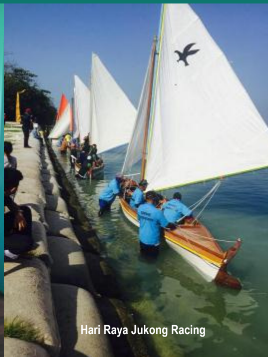
Hari Raya Jukung Racing