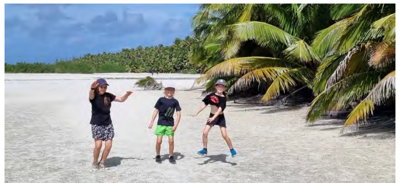
Cocos Kids Hash on Sunday 26.06.2022