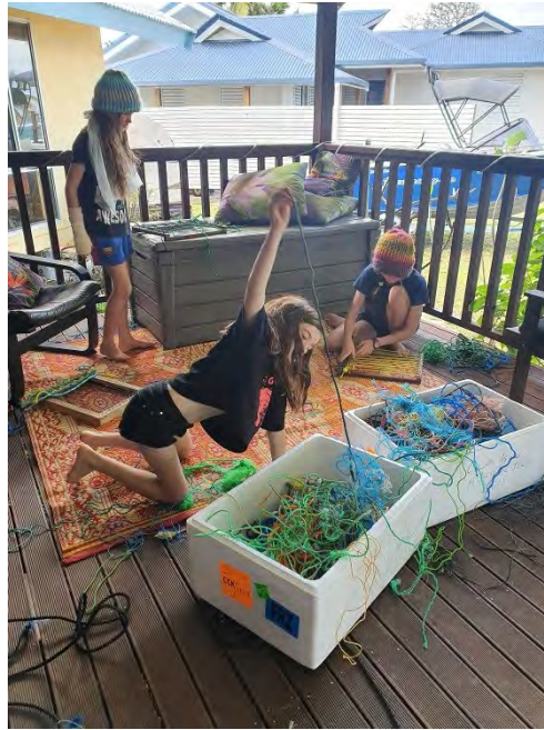
Faulkner children crafting. Weaving wall hangers using flotsom and jetsom off the beach, while Mum and Dad were away.