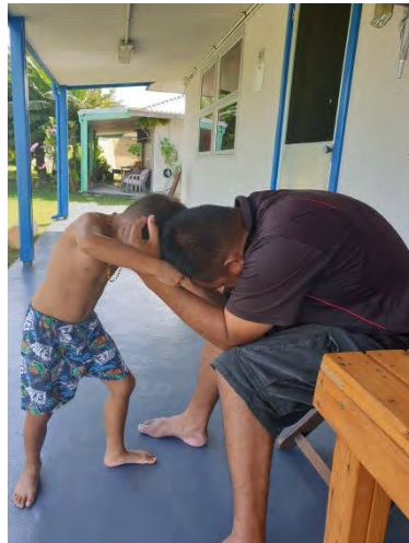
Last day of annoying Pak Thiya in Iso!