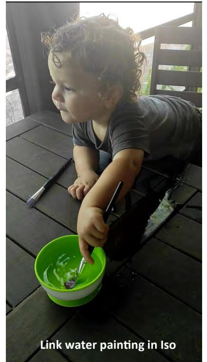
Link water painting in Iso