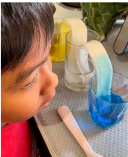
Fantastic home experiments to fill the day!